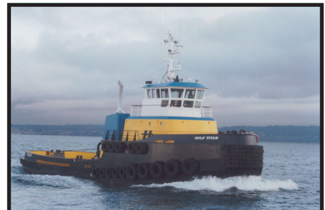
Find out what this tug boat has to do with the Auction